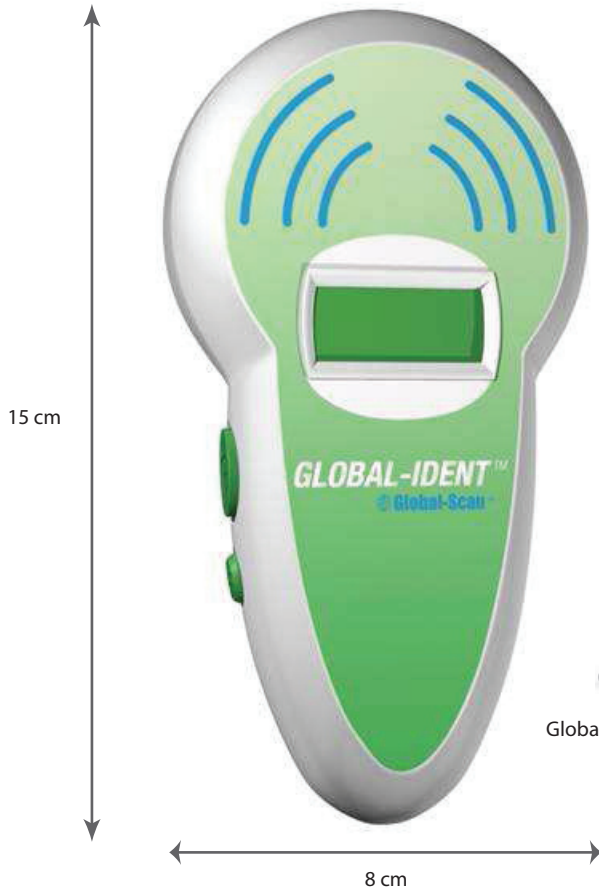
Global-ident connect microchip

The Global-ident Global Scan reader is an easy to use unit that is capable of reading all ISO Microchips. Global Scan can communicate through serial port and store up to 800 RFID codes.